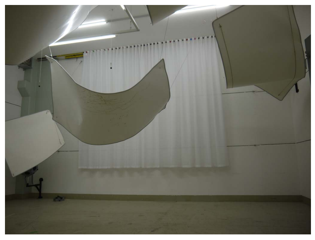
Figure B.1. Test object mounted in the reverberation room