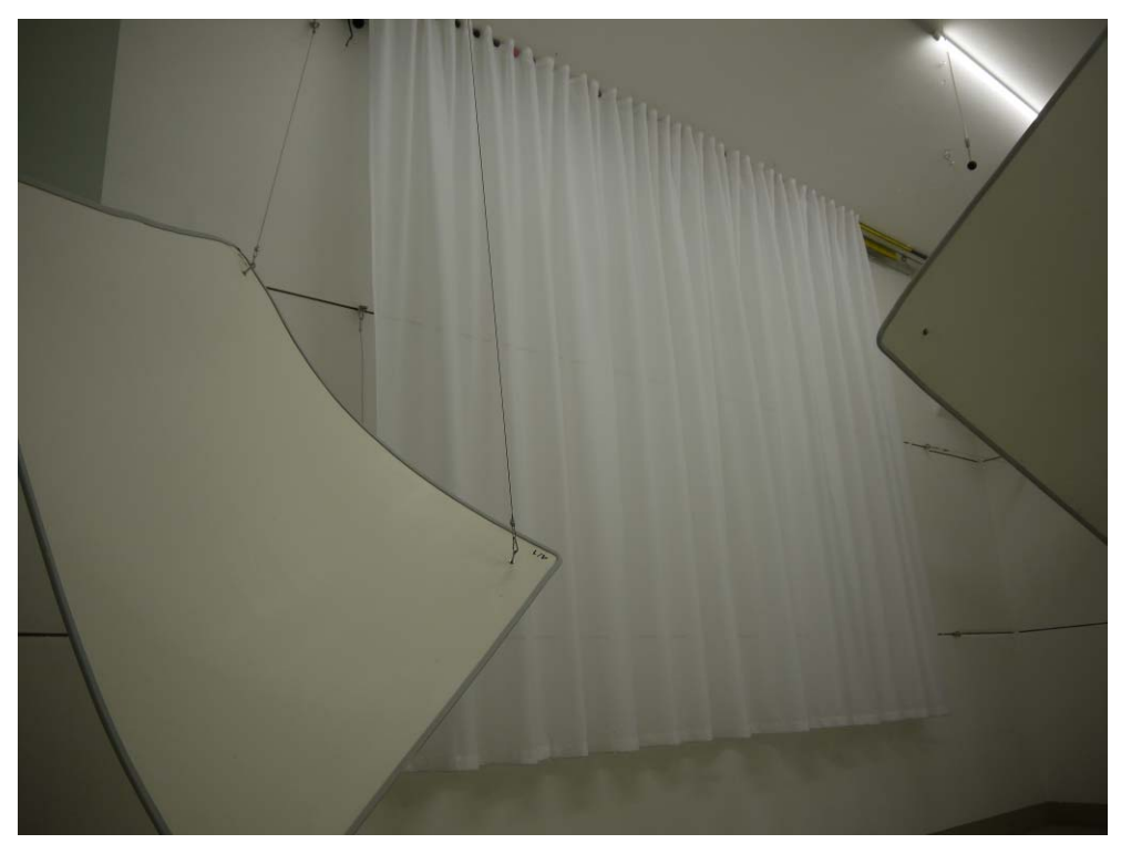
Figure B.2. Test object mounted in the reverberation room